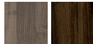
Elk (Textured) Gunstock (Textured)