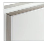
White with Metallic