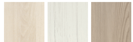
Antler Icy Avalanche Linea Nightfall Wharf (Textured)