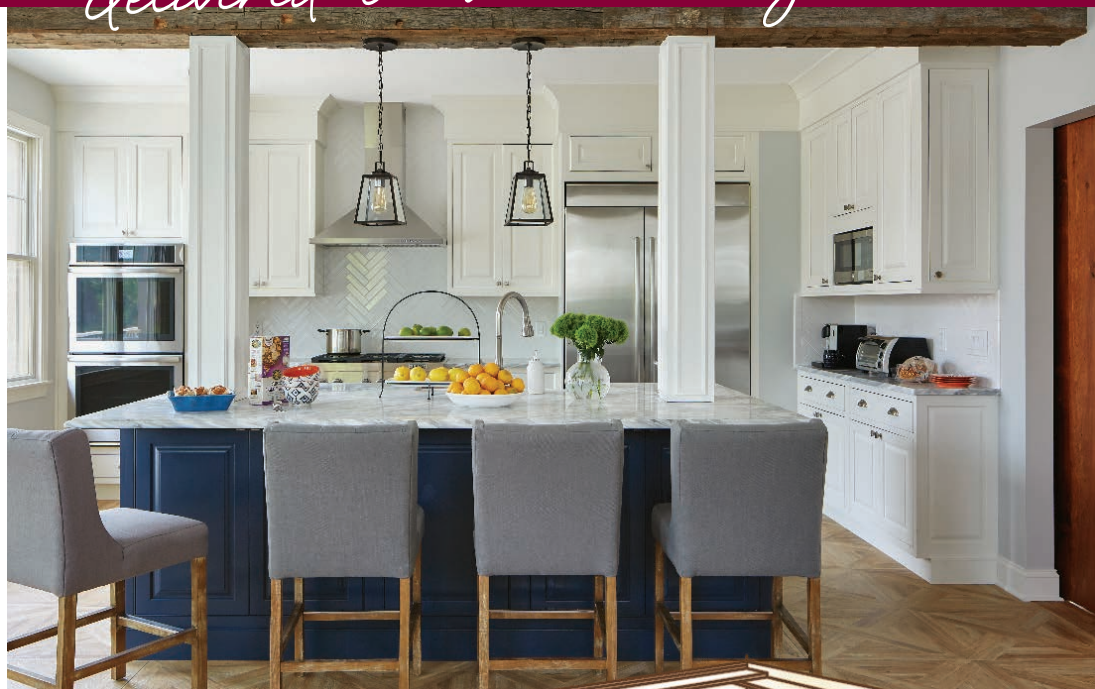
Overlay Construction Crew Series Construction

For more information, ask for the Cabinetry Comparison Workbook .